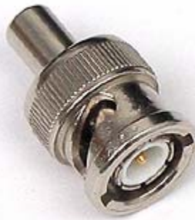
Figure 1: BNC Terminator